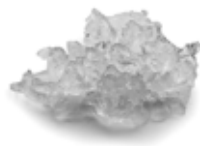
MF 36 Flake ice Residual water content 25%